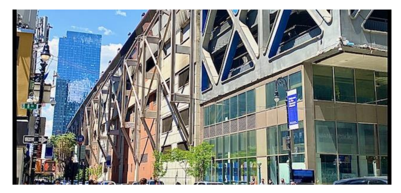
Port Authority Midtown Bus Terminal, Eighth Avenue and 40<sup>th</sup> Street